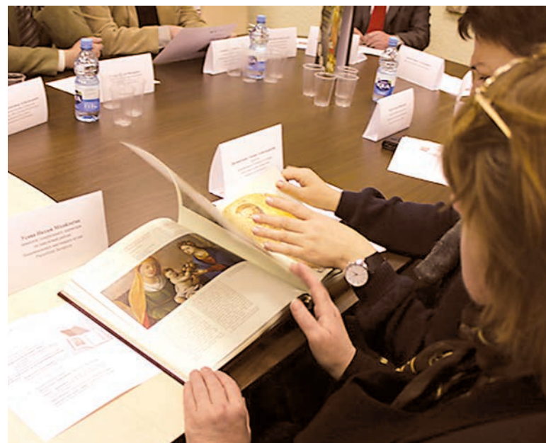
During presentation of the Treasures of Belarusian Museums catalogue