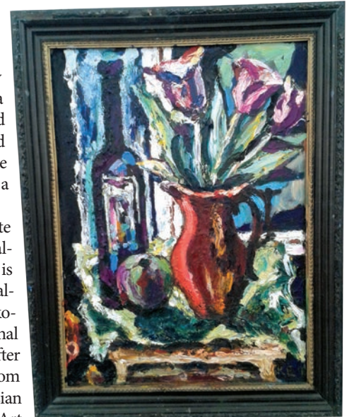
Ye. Korobushkin. The Tulips

Polotsk Sofia Cathedral: 12th Century , and St. Yevfrosiniya Church joined Old City and New City at the Artists to Nations all-Union Exhibition (Moscow, 1988).