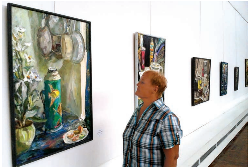
Much to see and admire at exhibition