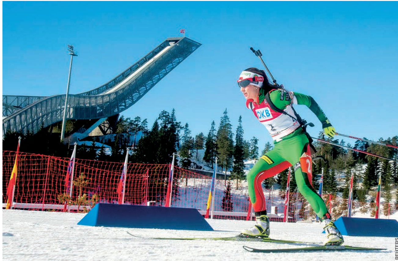
At end of season, Darya Domracheva hopes to perform confidently and successfully