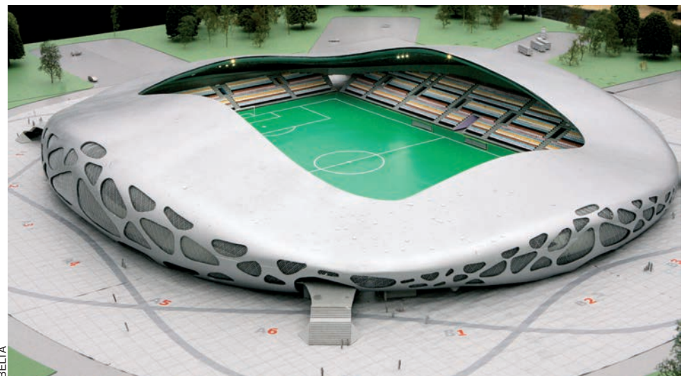
Model of future FC BATE stadium in Borisov

"The Borisov stadium is not just a commercial project.