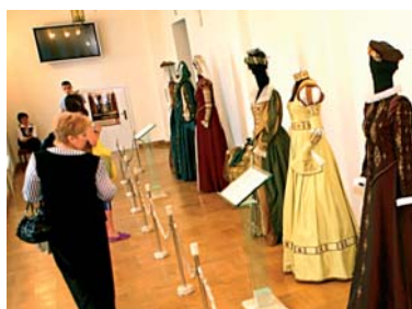
Radzivils’ costume exhibition

ry turn, we are reminded of the former owners and the time in which they lived. Walking from one hall to another, you can easily imagine strolling through the Winter Palace, Peterhof or the Kremlin’s museum. Of course, the scale is smaller but the decoration of the rooms is quite comparable. Meanwhile, there is the harmonious combination of historical interiors and museum displays.