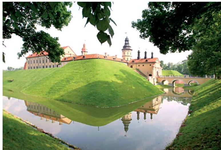
The palace and park ensemble of 16-19th century Nesvizh

History really can revive right before our eyes. Recently, the gate keepers and guards of Nesvizh Castle dressed in costumes from the time of prominent Radziwill Sierotka. He welcomed guests himself at the door, noting that he had built the castle himself and that it now enabled ‘our descendants to be proud of their history’.