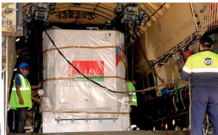
Belarusian satellite before launching