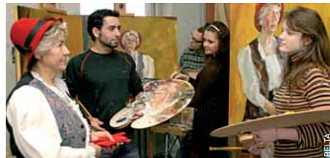
Students attend classes in pictorial art