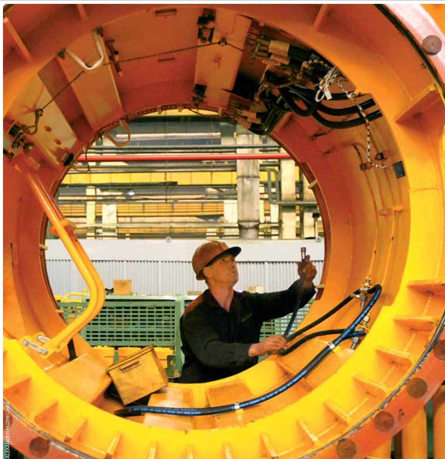
Such industrial giant as Belarusian Automobile Works could be the first to place shares on international market