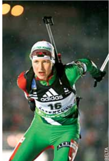
Darya on victorious ski track

Either Siebert's prayers or the weather gods helped her find all her targets; coupled with strong ski work, she took her place among the leaders by the fifth lap, creating a 'decent margin' ahead of Anna Maria Nilsson of Sweden (who came second for the first time in her career)