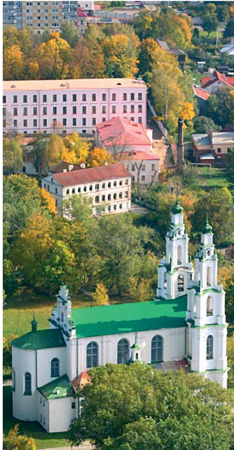
Polotsk's jubilee is to become an international event

Undoubtedly, Polotsk has a rich and glorious history. Among the most ancient in Eastern Europe, the city was first mentioned in the Tale of Bygone Years , in 862. Its advantageous geographical position on the 'Varangians to the Greeks' trade route helped Polotsk become a key trading and cultural centre in medieval Europe. It is directly connected with such names as Yevfrosiniya Polotskaya, Fran-