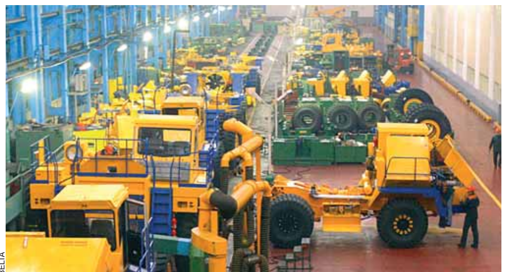
Conveyor belt doesn't stand still at Automobile Works in Zhodino

The contract is BelAZ's largest to date, although it has already delivered 82 machine units to Kuzbassrazrezugol JSC this year, with one more heavy duty dump truck to be supplied by the end of 2011. The Belarusian Automobile Works and the Russian coal company are long-term partners, having been working together since the early 1960s, when the first Belarusian heavy duty dump trucks appeared at Kuzbass' open-pit coal mines. Since then, BelAZ has supplied quarry machinery boasting the latest innovative devel-