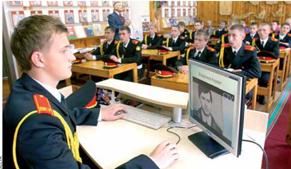
Future officers must be well educated

Formerly, the Luzhesno boarding school primarily taught village schoolchildren