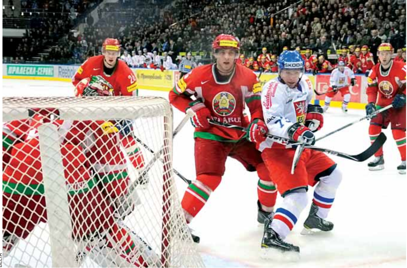
Match between Belarus and Czech Republic

Belarus' next sparring partner was the current world champion, the Czech Republic. Minsk-Arena, the biggest rink in Belarus, hosted the event for the first time, giving local fans a real treat. The match was a success for the hosts, who won 3:2 (after a penalty shootout). Previously, Belarus and the Czech Republic have met eleven times, with all matches won by the Czech squad. The repeat match — held the next day in