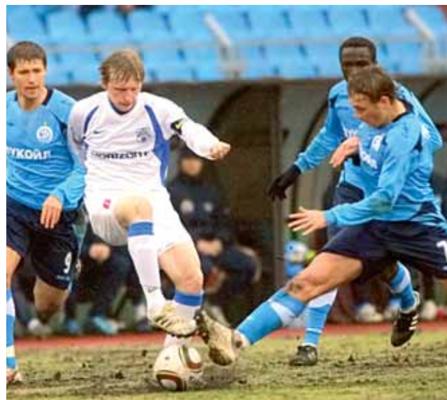
First matches of championship meet fans' expectations