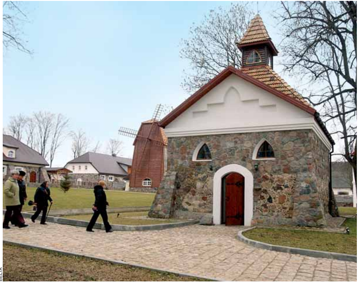
Rural idyll is affordable to most demanding tourists

The Naroch area is among Belarus' most interesting tourist destination, with almost 120,000 visitors last year. The Head of the Minsk Re-