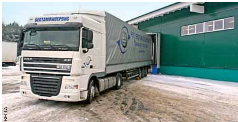
Transport-logistics centre in Brest

Interest in Belarus is growing, as confirmed by the numerous guides being released in foreign languages abroad. With help from the National Tourism Agency, Bradt Publishing House released its second guide on Belarus this year, in English. Several months ago, the first French-language guide was published, by famous Petit Fute Publishing House.