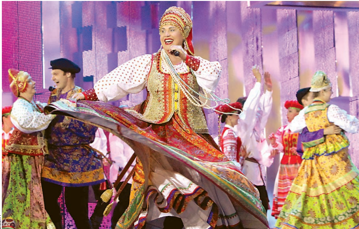
The People's Artiste of Russia, Nadezhda Babkina became the owner of special award

In response to the congratulations and kind words, Nadezhda Babkina noted the big role of the Slavianski Bazaar in the unification of people. Such activities remind the Slavonic people that, regardless of artificial borders, they are natives of one land, in their culture they have much in common that unites at a genetic level. Slavianski Bazaar welcomes