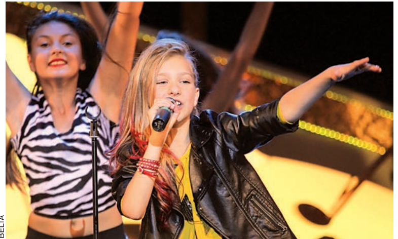
Zinaida Kupriyanovich performing

According to the Belarusian contestant, Zinaida Kupriyanovich, from