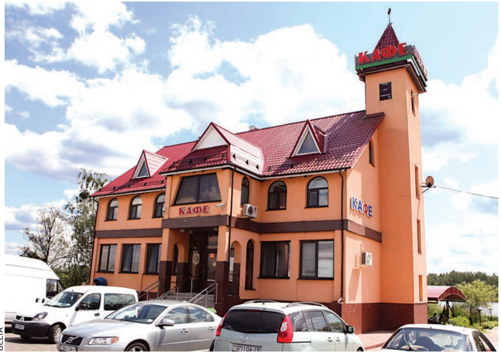
The Valentina roadside service station in the Ivatsevichi District