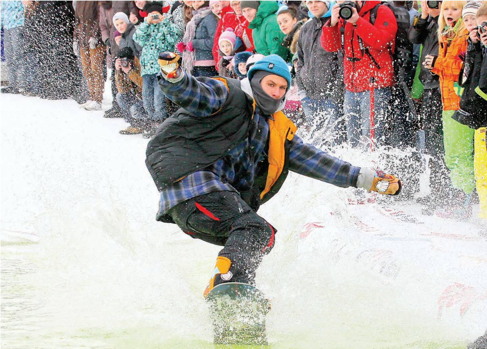
Springboard dives in the pool with cold water finishe winter season at Silichi Ski Centre